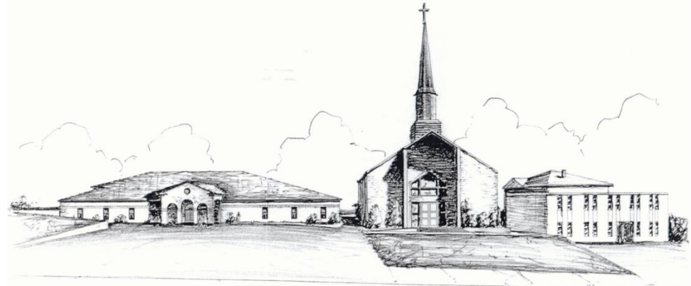
DOUBLE SPRINGS BAPTIST CHURCH

1130 Double Springs Church Road Shelby, North Carolina 28150