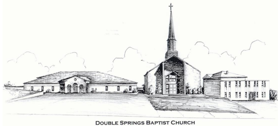
DOUBLE SPRINGS BAPTIST CHURCH

1130 Double Springs Church Road Shelby, North Carolina 28150